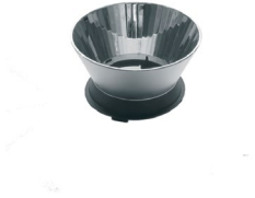
Kep Kyclos Perfetto Reflector