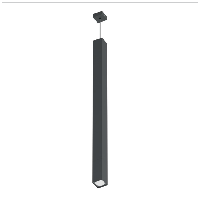
CUBIC LED +1200