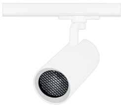
Point LED Shutter honeycomb Pieces in set: 1